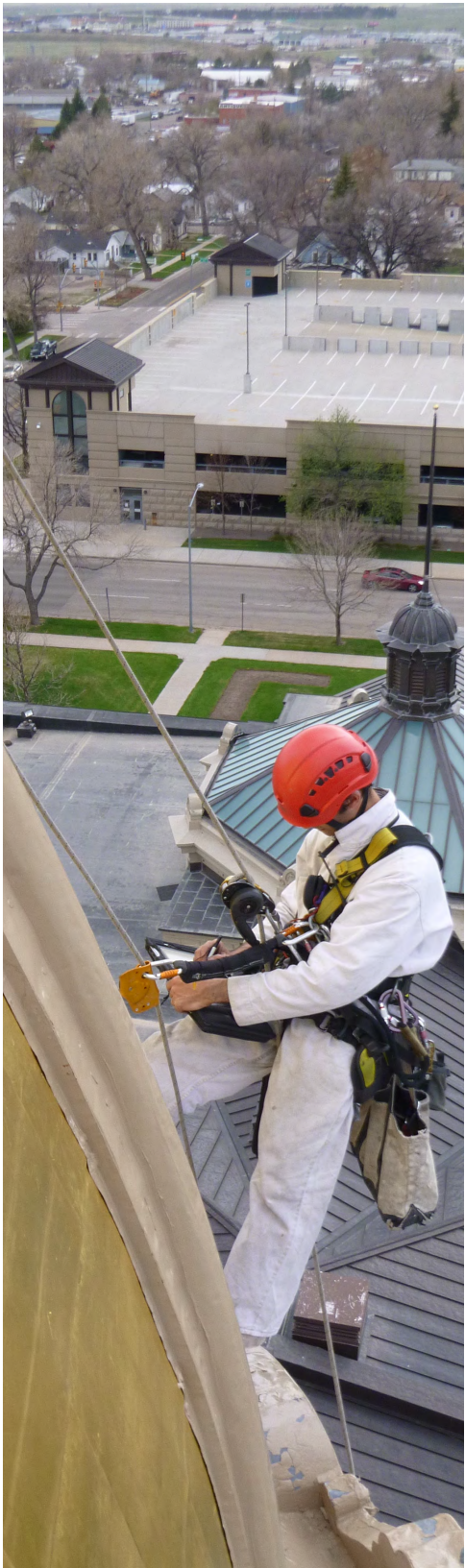
Figure D-1. Capitol Dome Survey Performed by Members of the HDR/PDP Design Team.